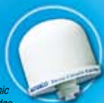
Dome Ceramic Cartridge