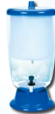
Clearware 6L 1 x Standard Ceramic Cartridge