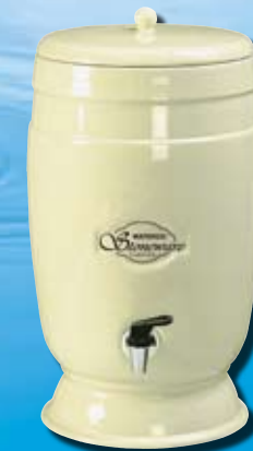
Stoneware 8L 1 x Standard Ceramic Cartridge