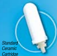
Standard Ceramic Cartridge