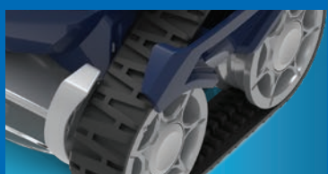
New Track Guard