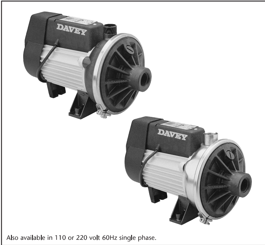
Also available in 110 or 220 volt 60Hz single phase.